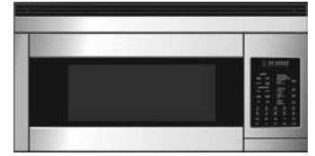
CMOH30SS Over the Range Microwave