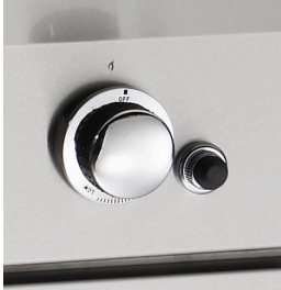
PUSH BUTTON ELECTRONIC IGNITION