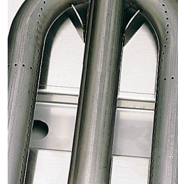
STAINLESS STEEL BURNERS