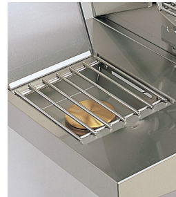
FLUSH MOUNTED SIDEBURNER