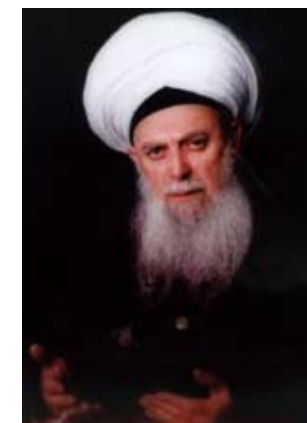
Mawlana Sheikh Nazim

SALTANATSIZ DÜNYA NİZAMI var deyenler, Dünyanın bugünkü haline baksınlar ve görüşlerini değerlendirsinler!