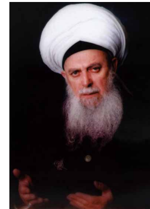
Mawlana Sheikh Nazim

VOL. 2, ISSUE 17: 10 JUMMADA AL-ULA 1431 23 APRIL 2010