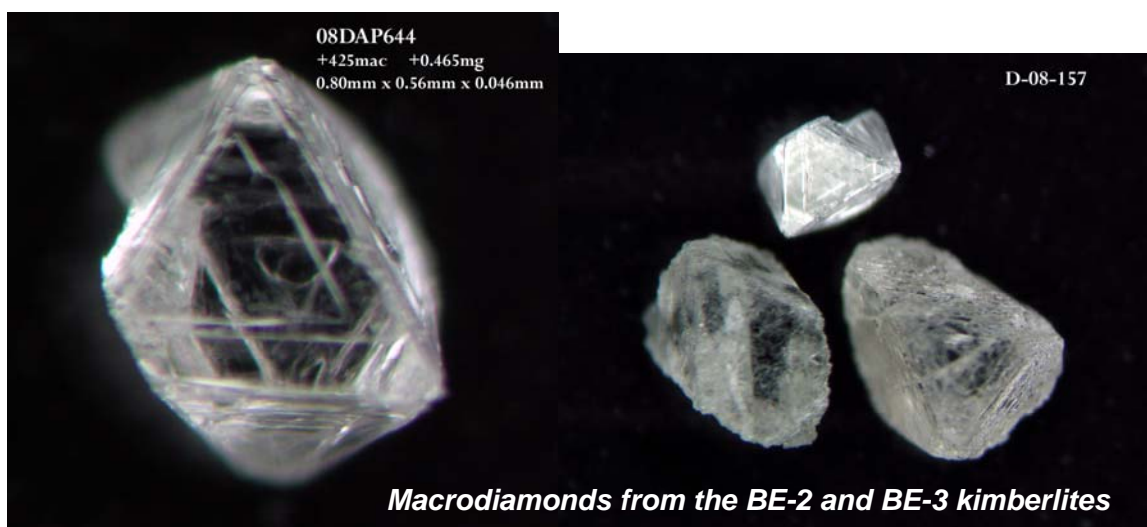
Macrodiamonds from the BE-2 and BE-3 kimberlites