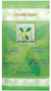
Vanilla Bean 453g $10.95