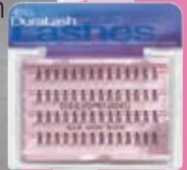
DuraLash Regular, Natural or Flares - $6.95