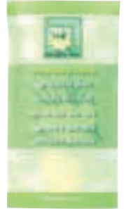
Citrus & Aloe 453g $9.95