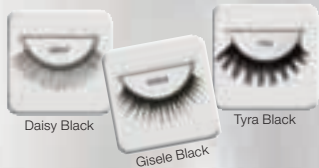
Runway Lashes $7.95ea