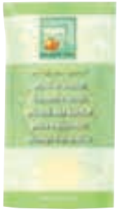
Peach & Juniper 453g $9.95