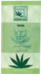
Hemp 453g $10.95