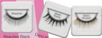
Fashion Lashes $6.95ea