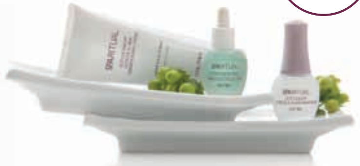
VEGAN NAIL TREATMENT ELIXIRS $17.95ea

NEW LACQUER COLLECTION - 5ML MINI LACQUERS COMING SOON