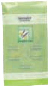
Lavender & Ylang Ylang 453g $9.95