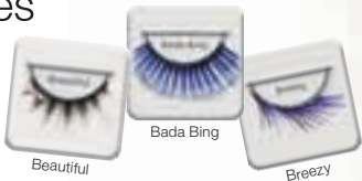
Wild Lashes $7.95ea