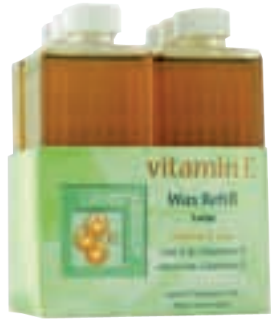
Vitamin E Wax 80g 6 pack $21.95