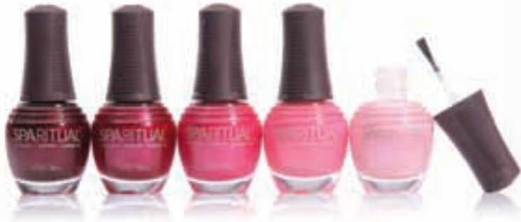
VEGAN NAIL LACQUERS $11.95ea

VEGAN ..... FORMALDEHYDE TOLUENE & DBP FREE