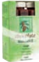
Chocolate 80g 3 packs $13.95