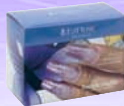
Dare to be Dazzling kit