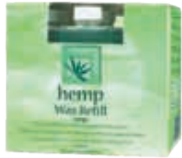
Hemp Wax 80g 12 pack $49.95 80g 72 pack $269.95