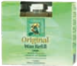
Original Wax 80g 12 pack $49.95 80g 72 pack $269.95