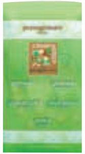
Pomegranate 453g $10.95

ALL CLEAN +EASY PARAFFIN WAX REFILLS JULY 12 TH – AUGUST 20 TH 2010 OR WHILE STOCKS LAST