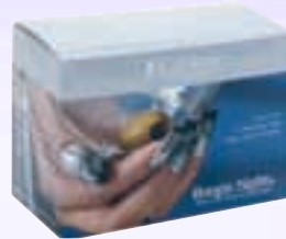
Walk of Fame kit