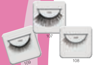
InvisiBand Lashes $6.95ea

JULY 12 TH - AUGUST 20 TH 2010 OR WHILE STOCKS LAST