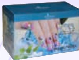
Carnival Collection Kit