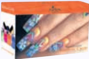
Rainbow Candy Collection