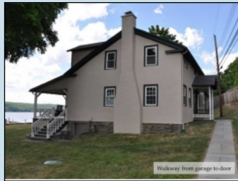
Walkway from garage to door