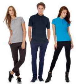
B&C Safran, B&C Safran Pure /women & B&C Safran Timeless /w.