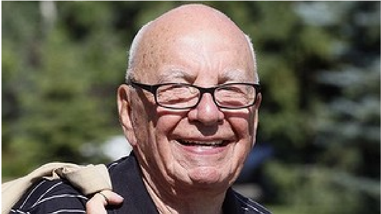
Rupert Murdoch is selling his New York townhouse just five months after buying it.