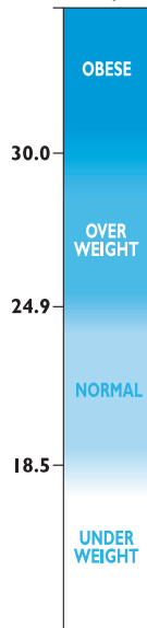
Body Mass Index (BMI)

Source: Centers for Disease Control and Prevention. Applicable to adults only.