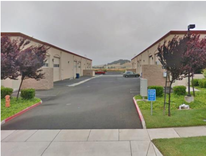
Entry to Back of Unit