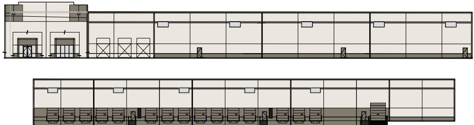
PHASE 1 CONCEPTUAL ELEVATIONS