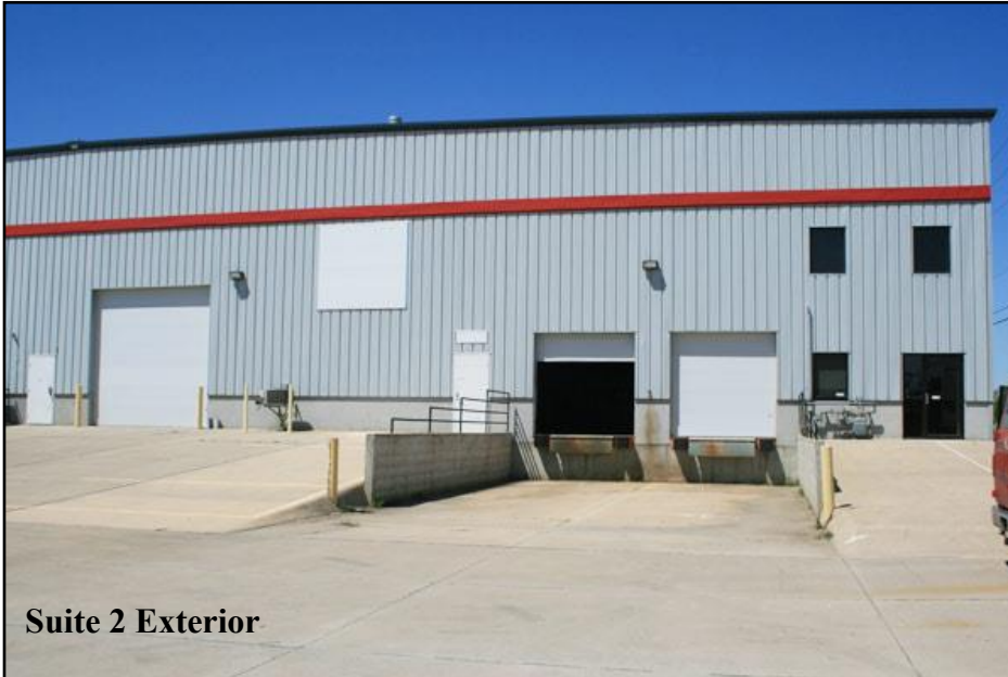
Suite 2 Exterior