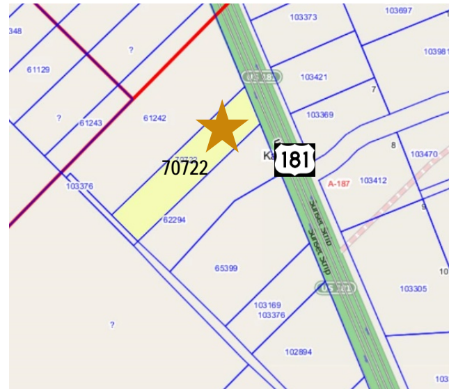
KARNES COUNTY APPRAISAL MAP

Anytime Fitness Domino's The UPS Store Agave Dental Tractor Supply Co