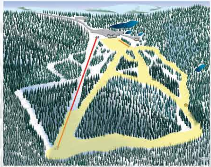
LAUREL MOUNTAIN NIGHT SKIING TRAILS