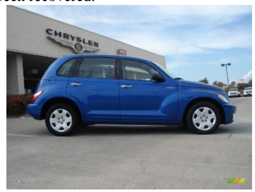
(Not the actual stolen vehicle)

It is believed that Jacsun's parents stole a blue 2006 Chrysler PT Cruiser, the vehicle is missing a bumper and the license plates have likely been removed. The family was seen in this vehicle, and are known to frequent of Slauson Avenue and Crenshaw Boulevard. The PT Cruiser has not been recovered.