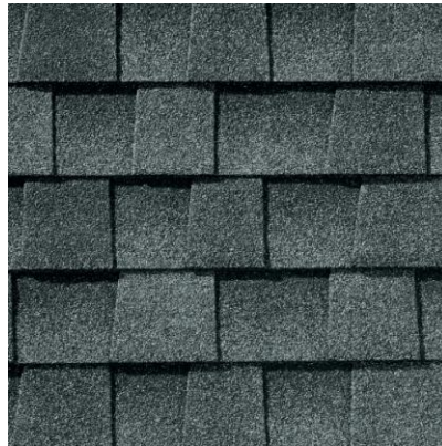
Timberline Natural Shadow Pewter Grey Asphalt Shingles #0600552