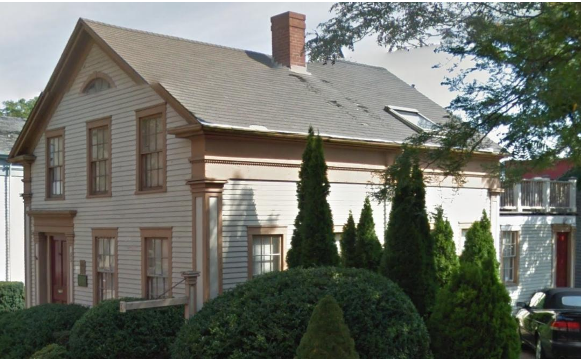
66 N Second Street-Exterior Rehabilitation