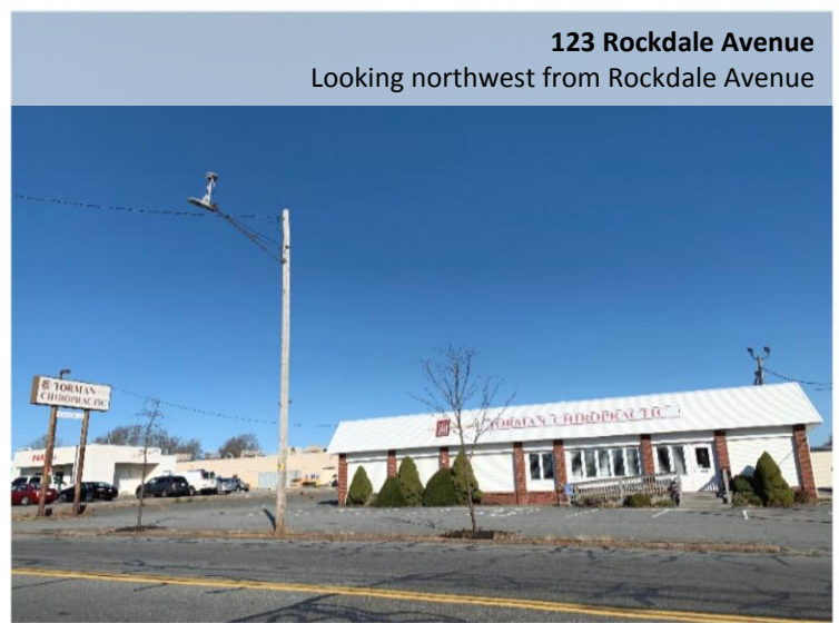
123 Rockdale Avenue