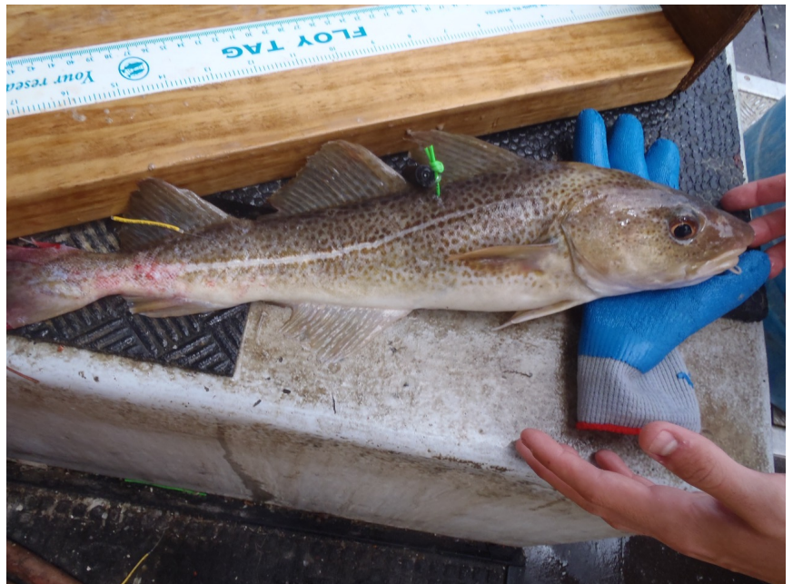
A double-tagged Atlantic cod (floy tag in yellow, acoustic tag in green) being measured on a cooperative research trip.