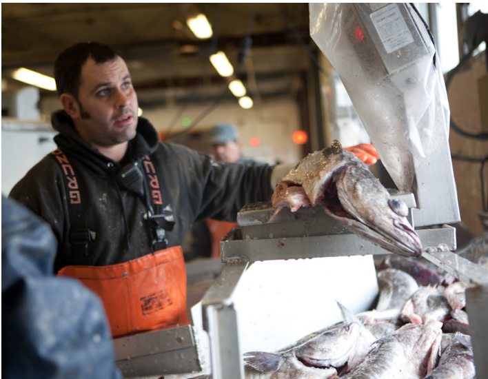
Weighing the catch.