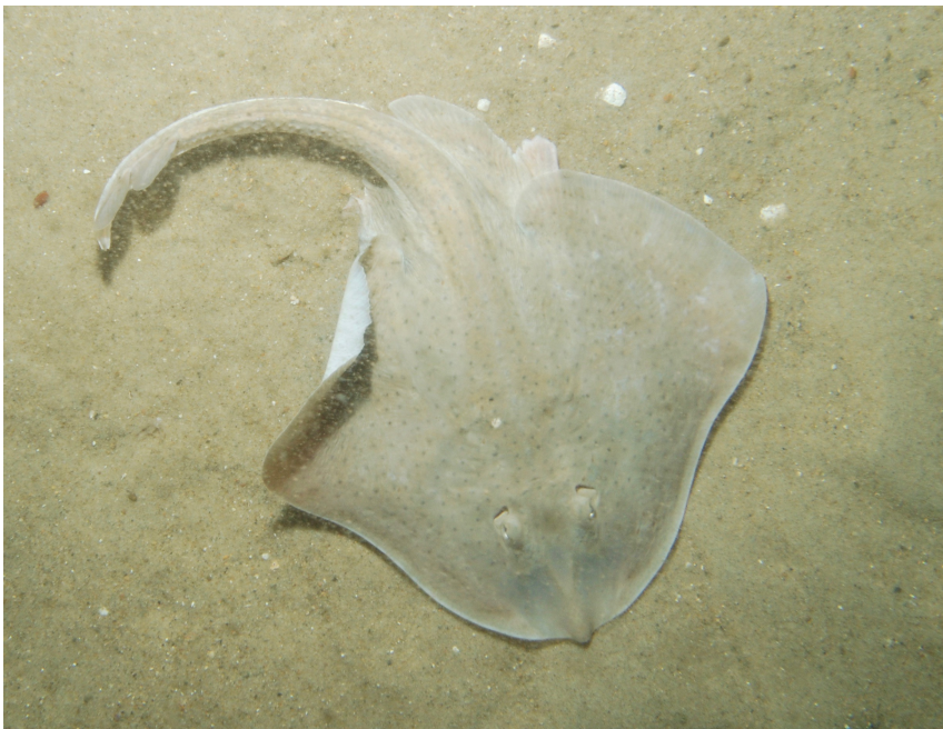
Winter skate, the primary target species of the wing fishery.

Although the Council initiated this action to consider alternatives for prolonging the length of the skate wing fishery, Framework Adjustment 6 also will benefit the skate bait fishery. Both segments of the skate fishery recently have been subject to late-season possession limit reductions that have made it uneconomical to conduct directed fisheries, thereby disrupting markets and business plans.