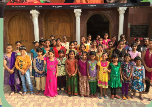
40 orphaned girls supported by the church