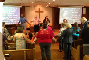
Worship at FBC Poteet