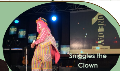
Sniggles the Clown