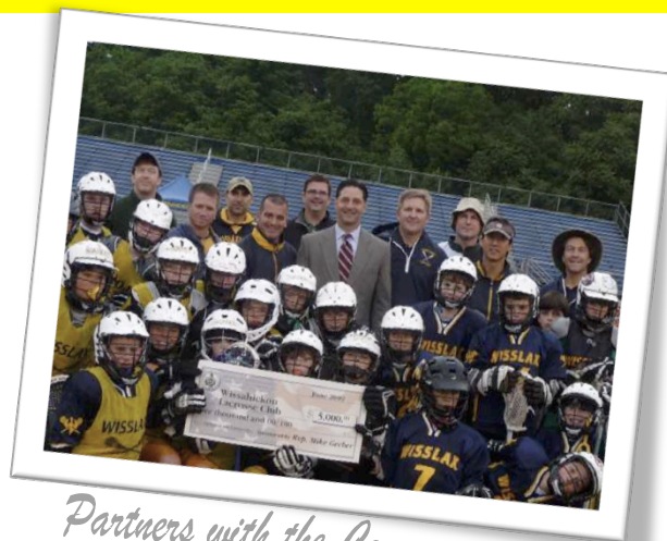
Partners with the Community