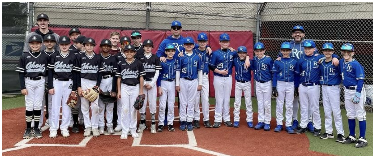
East Coast Ghost 11U and RCBC Ghost 11U Nationals