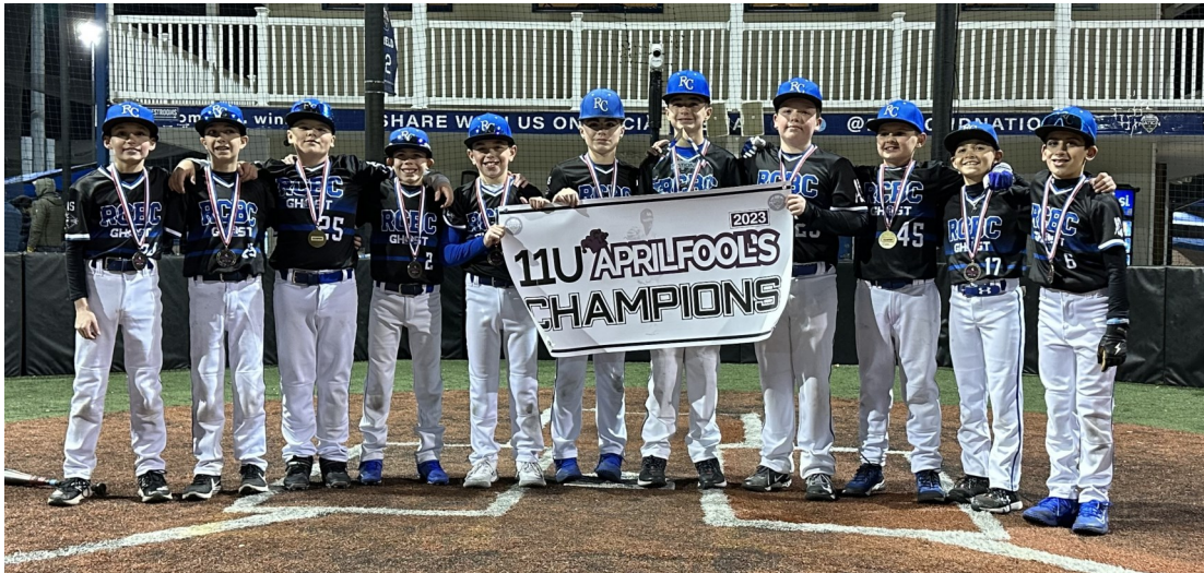
11U Nationals - Diamond Nation April Fools Champions