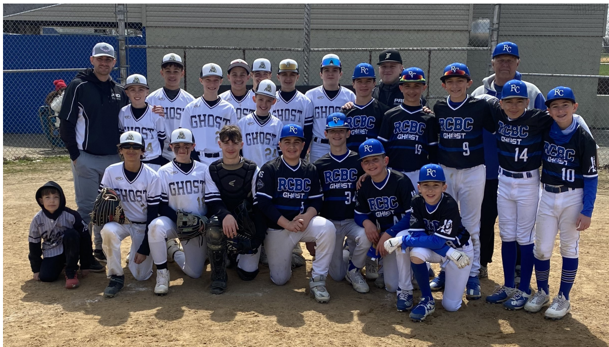
East Coast Ghost 12U Black and RCBC Ghost 12U Americans