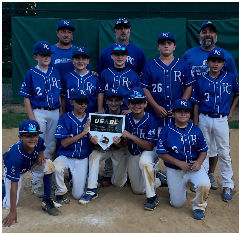
11U Americans USABL Summer Sizzler