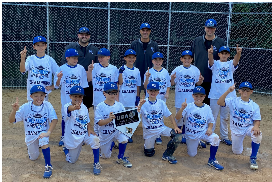
9U Nationals USABL 10U Fall Frenzy