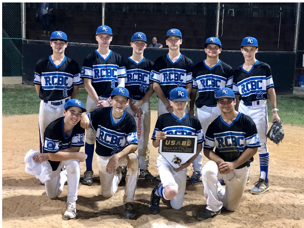
14U Royals USABL 15U Beast Of The East