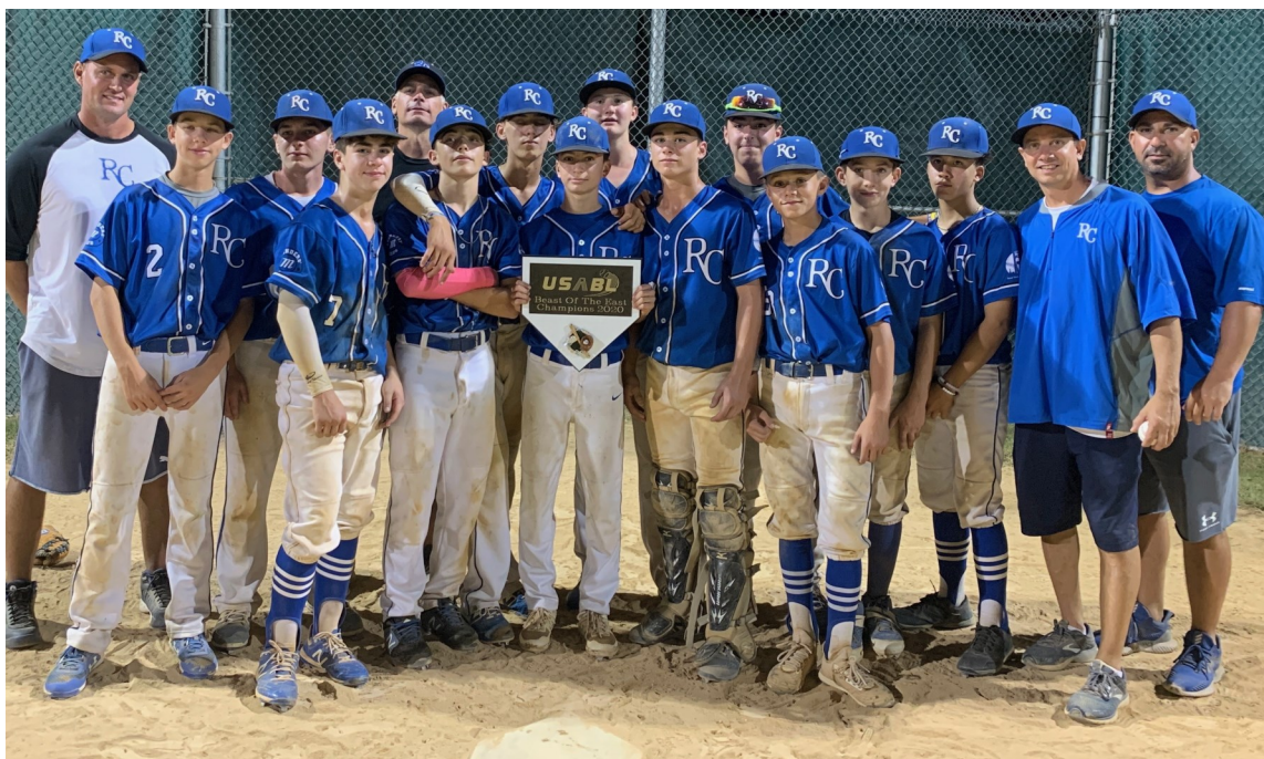
14U Americans USABL 15U Beast Of The East