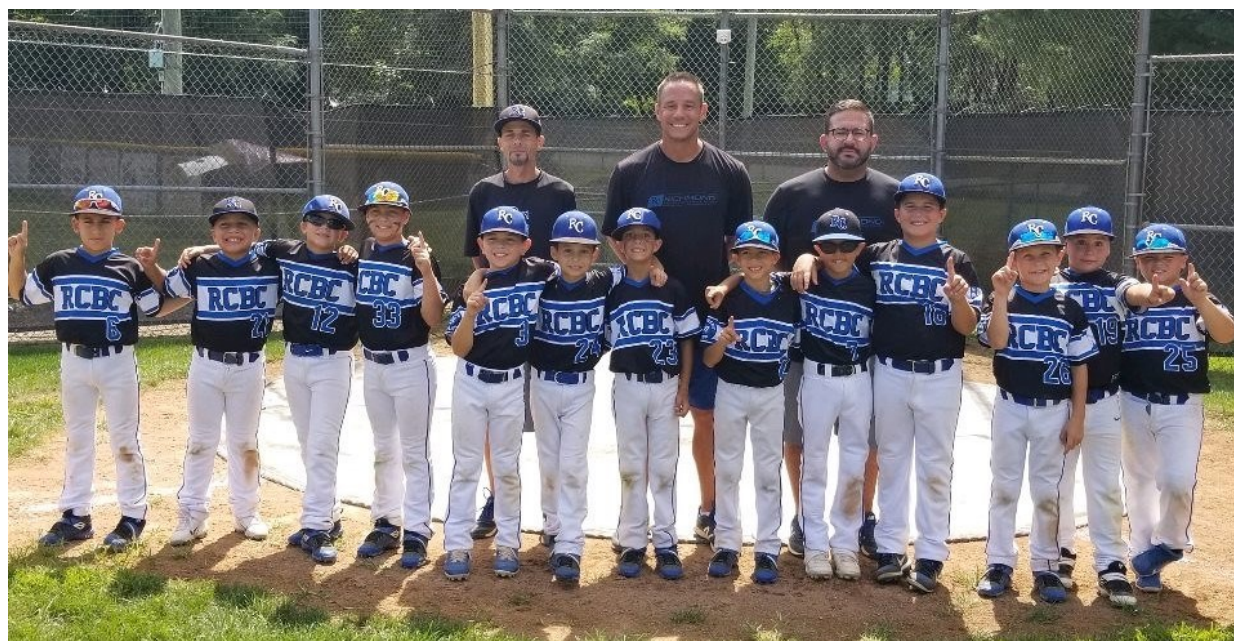
8U Nationals - USABL 9U Central Division Champions