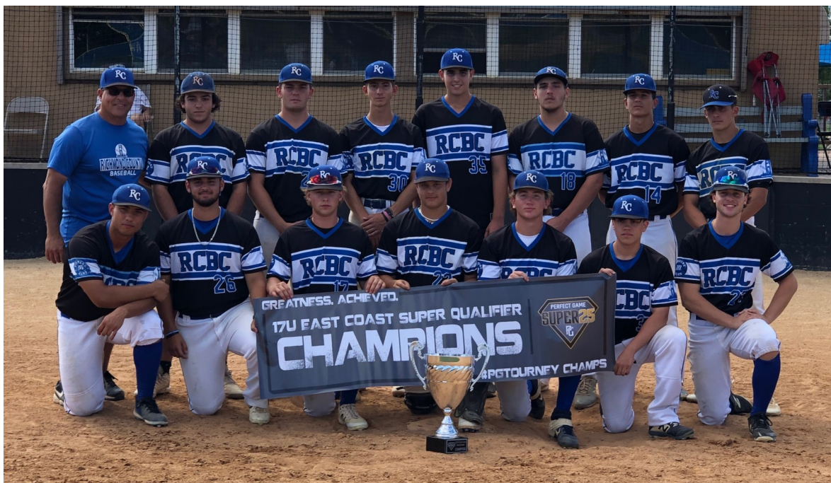
17U Nationals - PG East Coast Super Qualifier