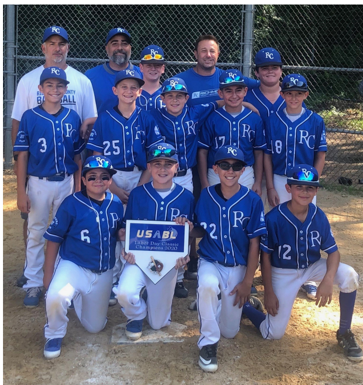
11U Americans USABL Labor Day Weekend Classic