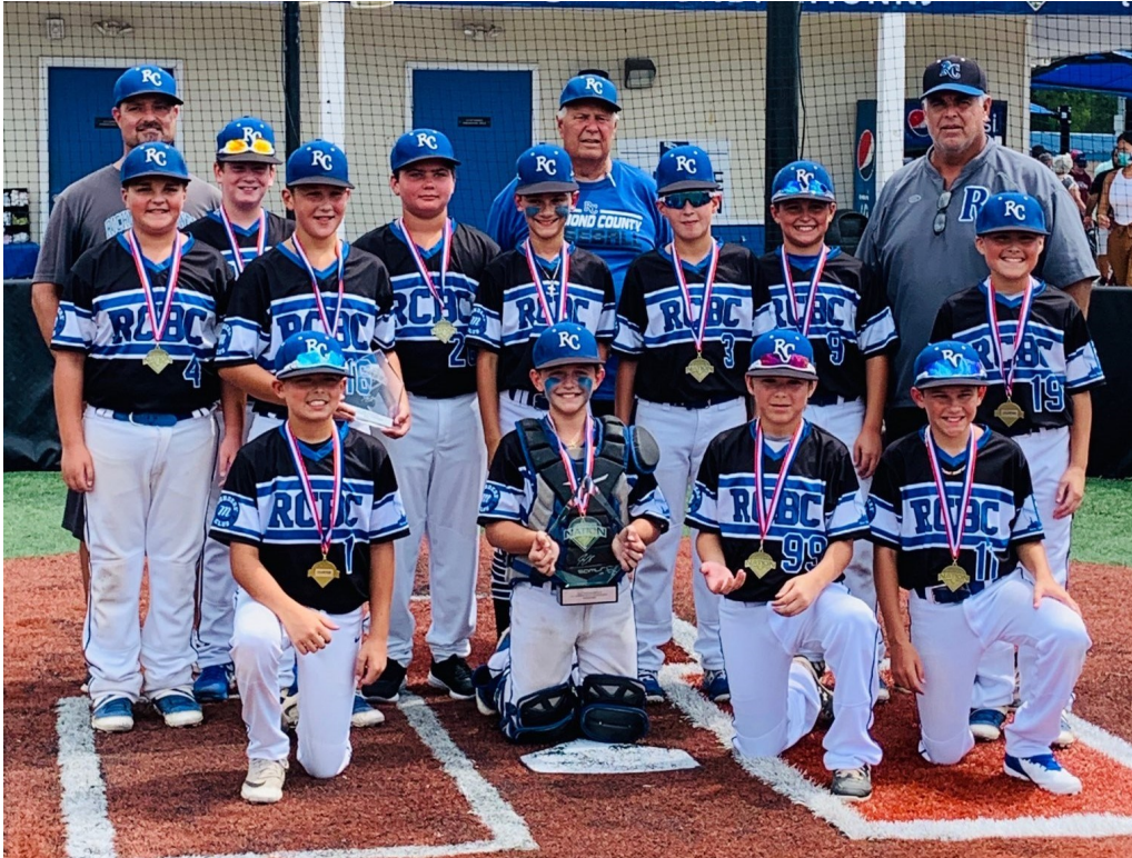
11U Nationals Diamond Nation Summer Bash