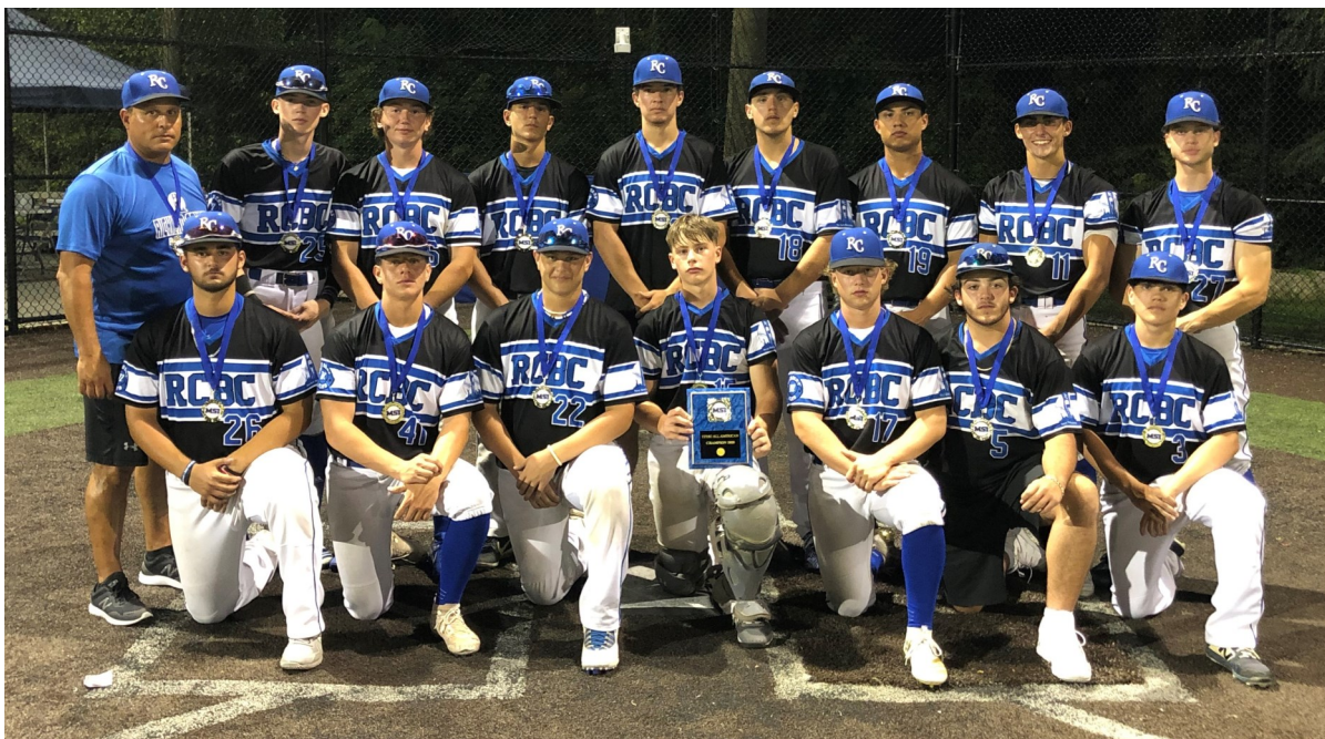
17U Nationals - Maplezone All American