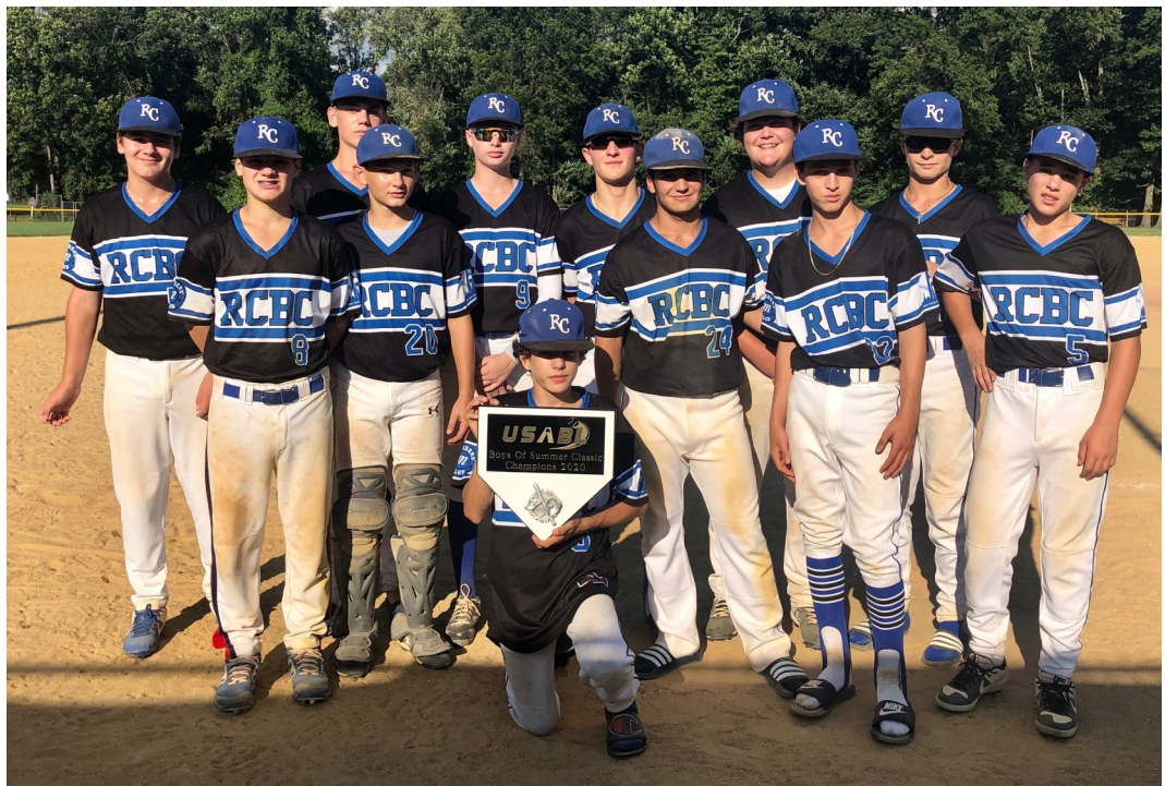
14U Royals USABL Boys Of Summer Classic