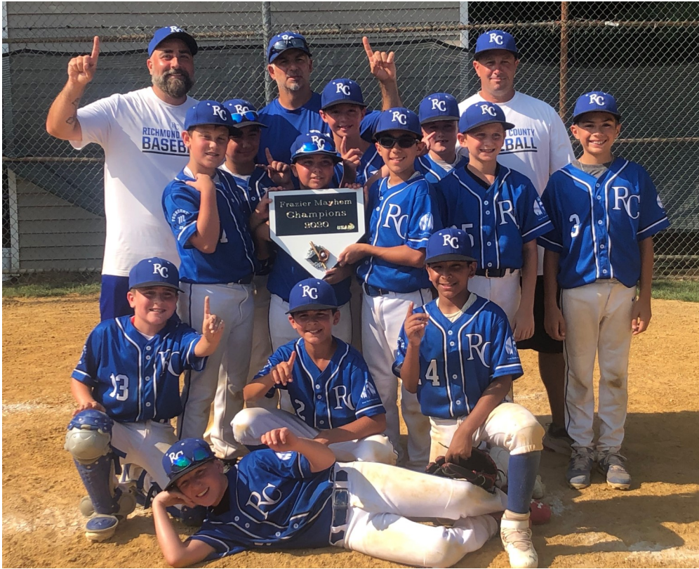
11U Americans - USABL Frazier Mayhem