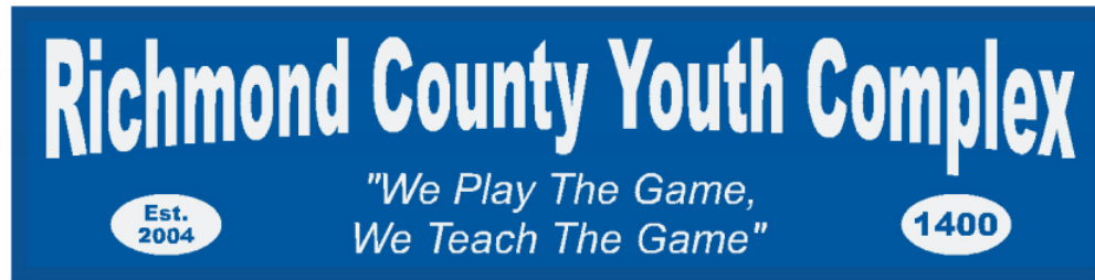
New Entrance Sign