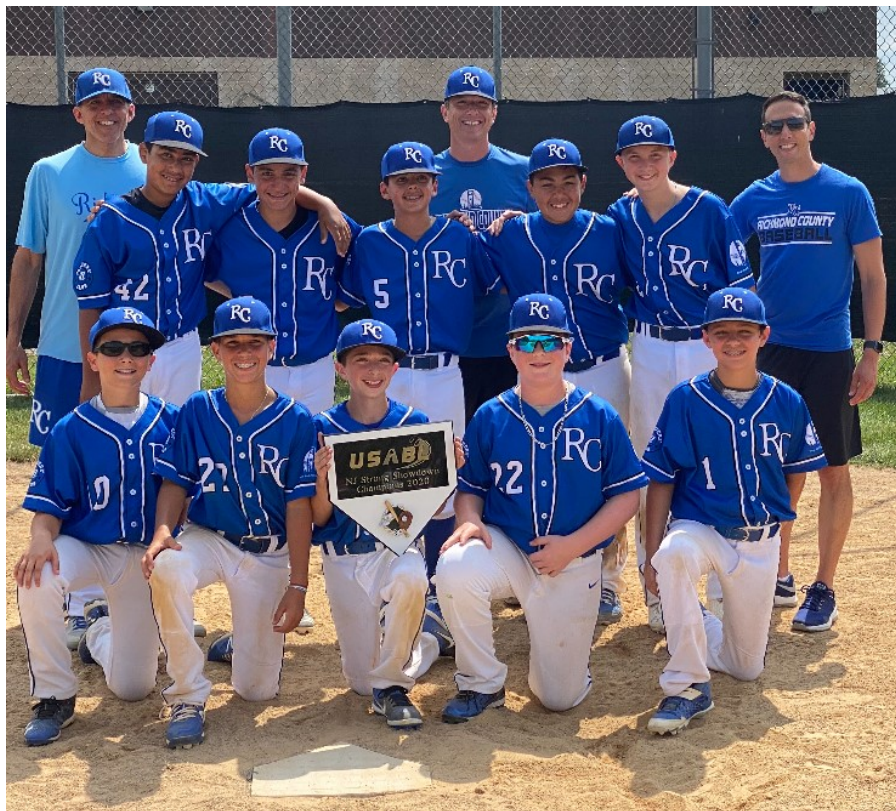
12U Nationals USABL NJ Strong Showdown