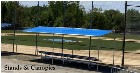
Stands & Canopies