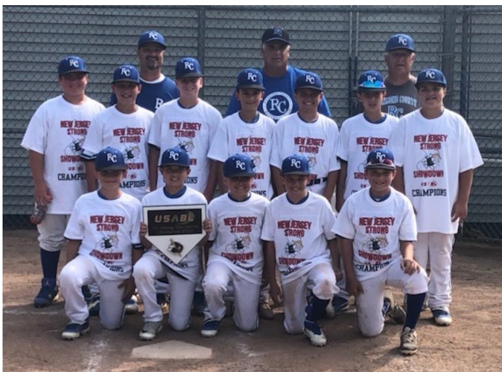
11U Nationals USABL NJ Strong Showdown