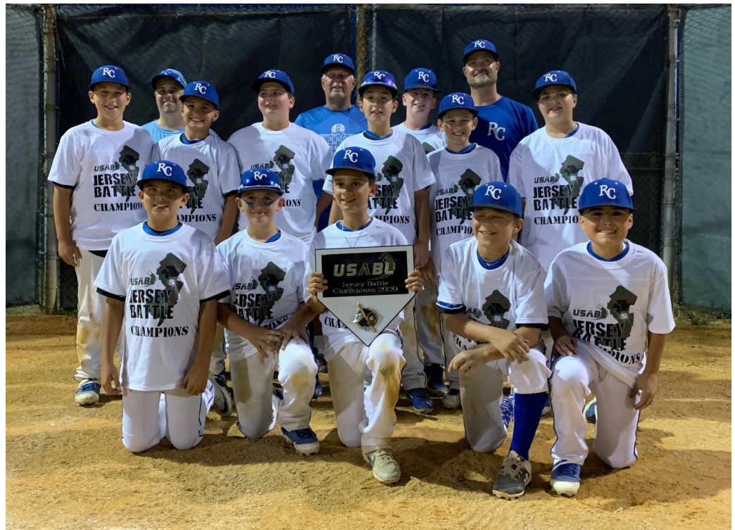
11U Nationals USABL Jersey Battle