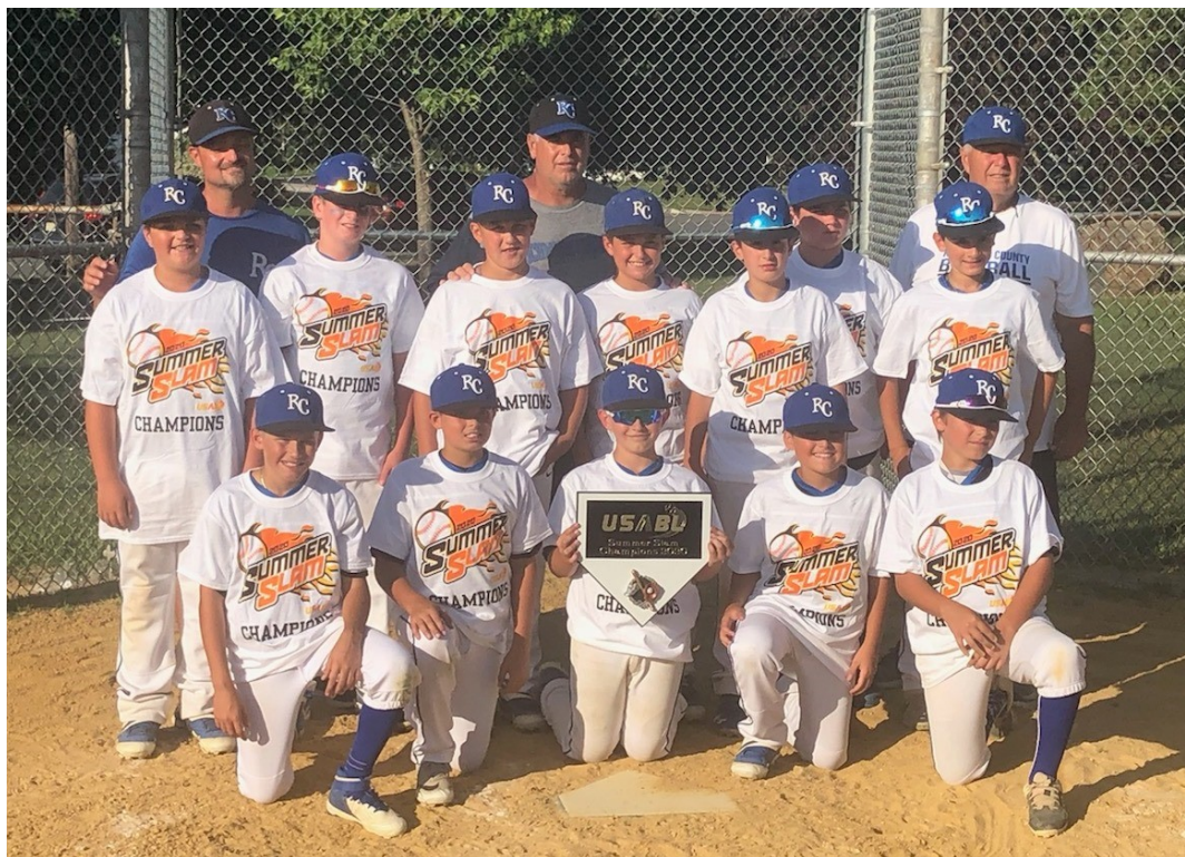
11U Nationals USABL Summer Slam