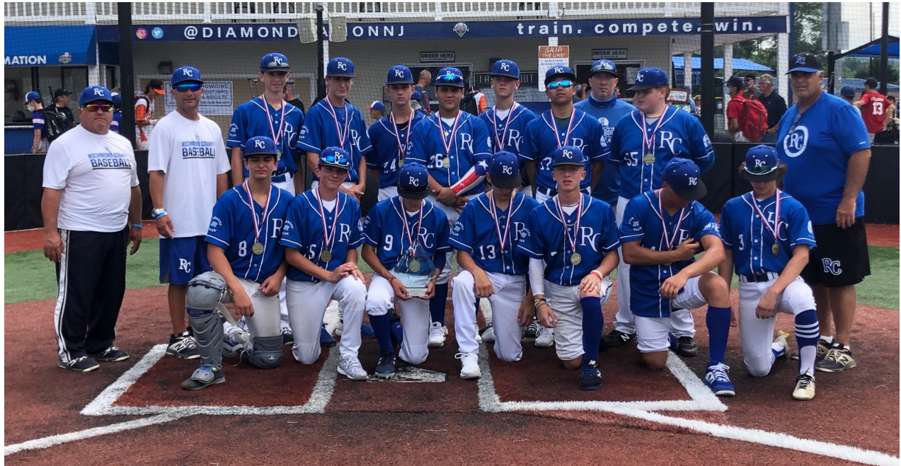
14U Nationals - Diamond Nation World Series