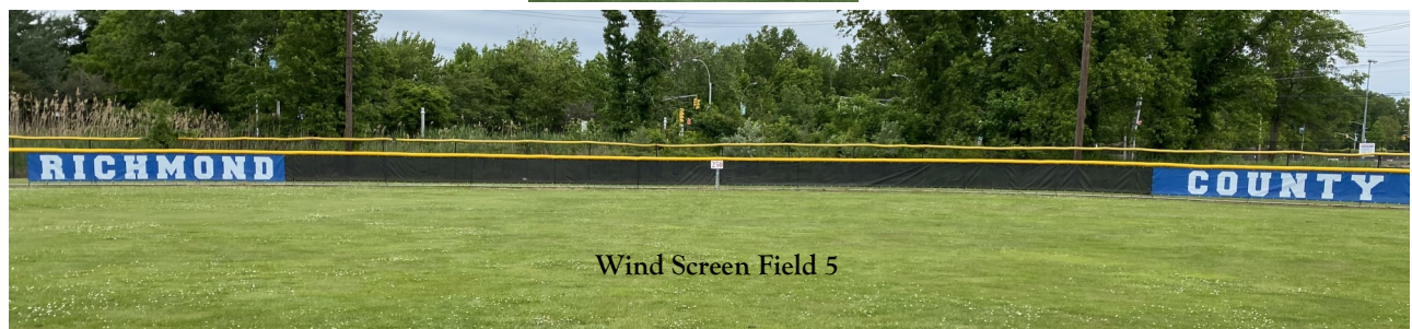
Wind Screen Field 5