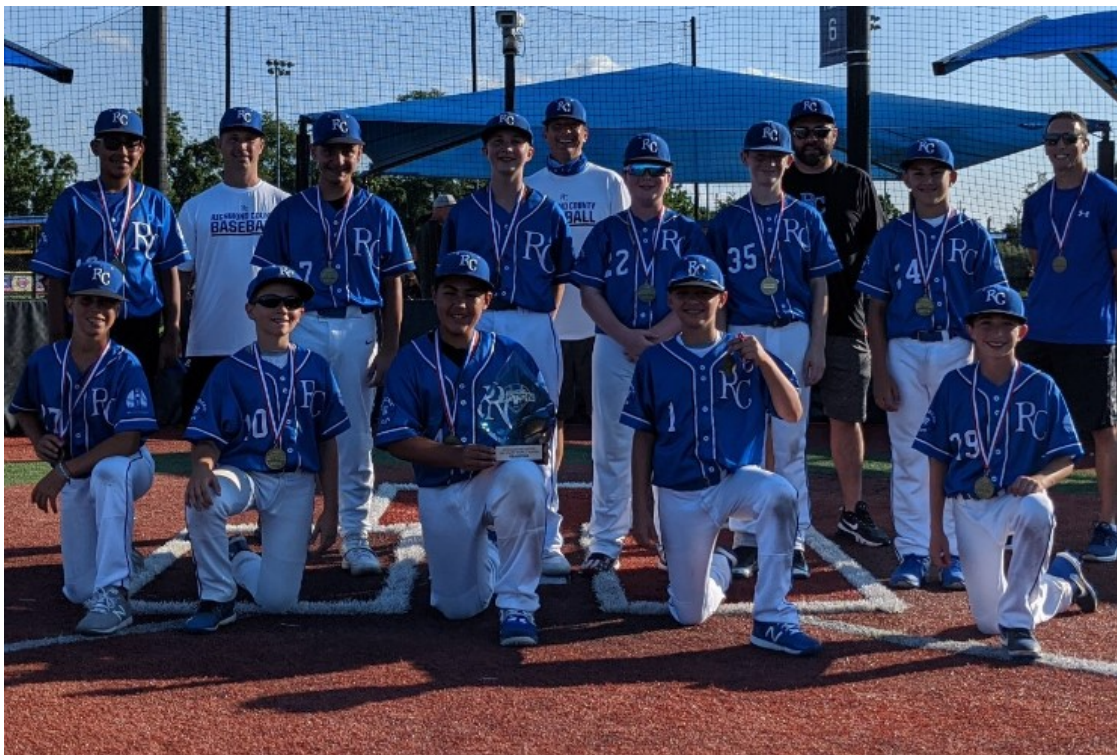
12U Nationals - Diamond Nation Youth World Series