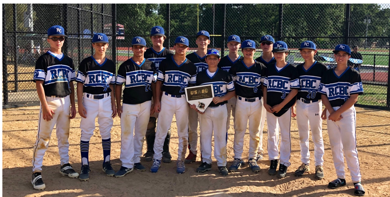
14U Royals - USABL Summer Slam