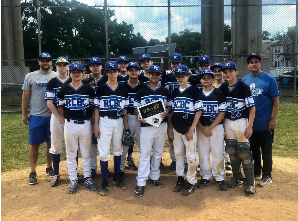
14U Royals USABL Jersey Battle