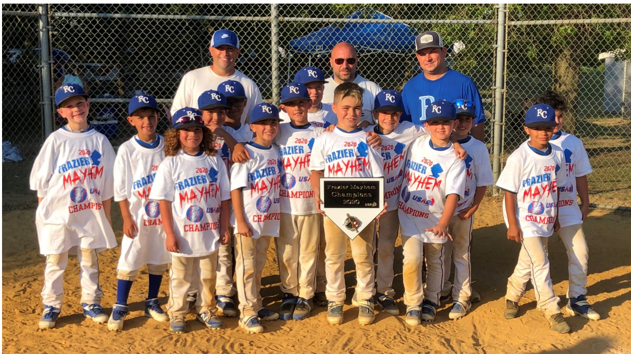
8U Americans - USABL Frazier Mayhem