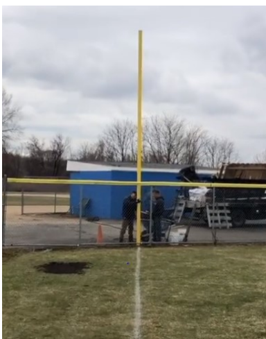
Foul poles on all fields