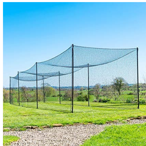
New batting cage netting