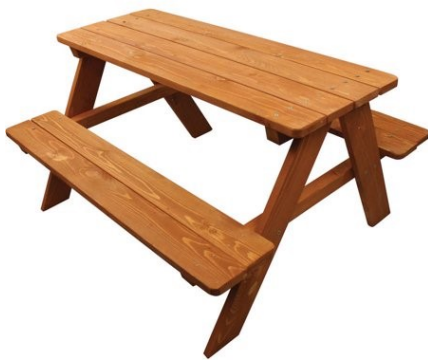
30 new picnic tables

Although baseball activity is on hold, we're continuing to make improvements to the Richmond County Youth Complex to enhance the playing experience and for spectator safety and comfort. We have completely leveled and reseeded all 5 fields resulting in superior playing surfaces. And we have upgraded all of our field maintenance equipment. Here are some additional items we are installing: