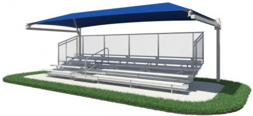
New bleachers with canopies