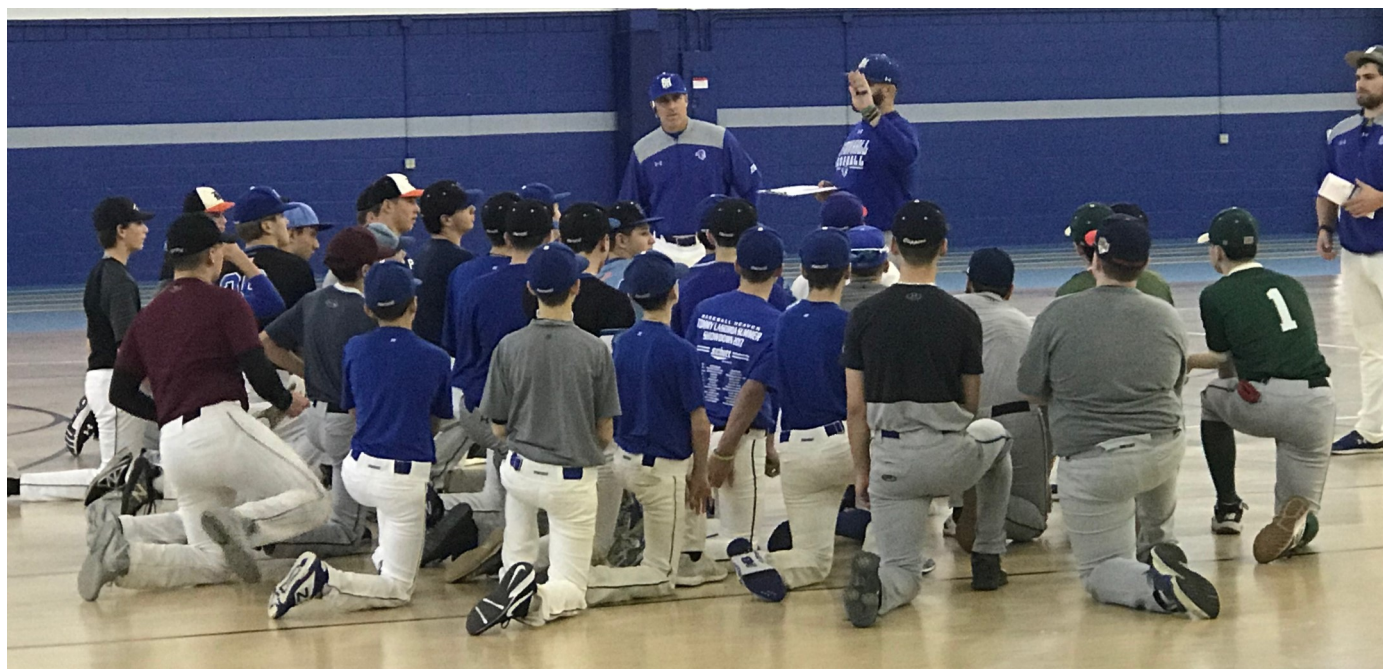
Seton Hall University