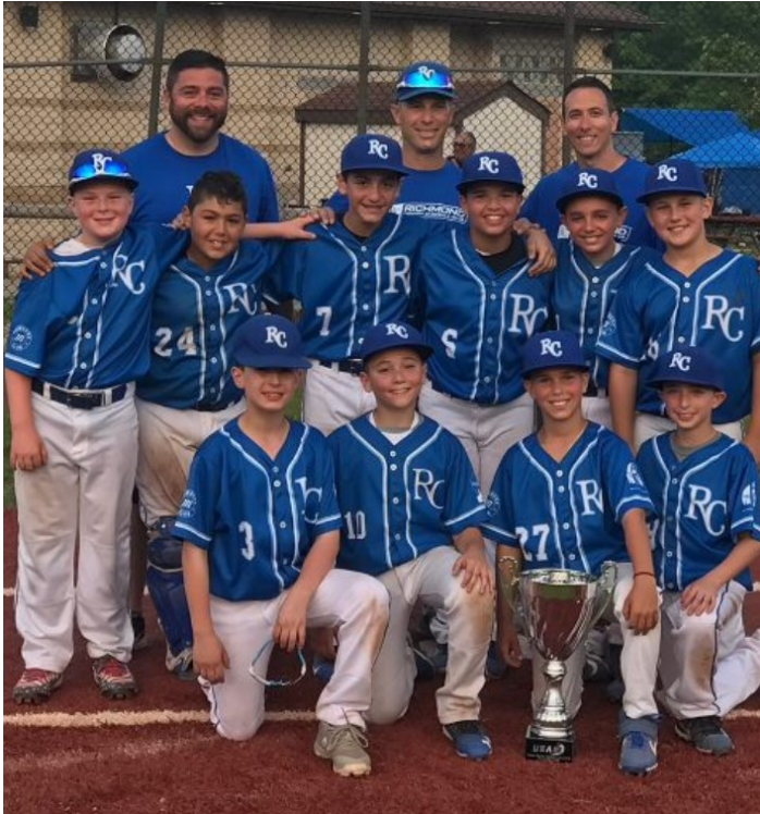
11U Nationals USABL World Series Qualifier