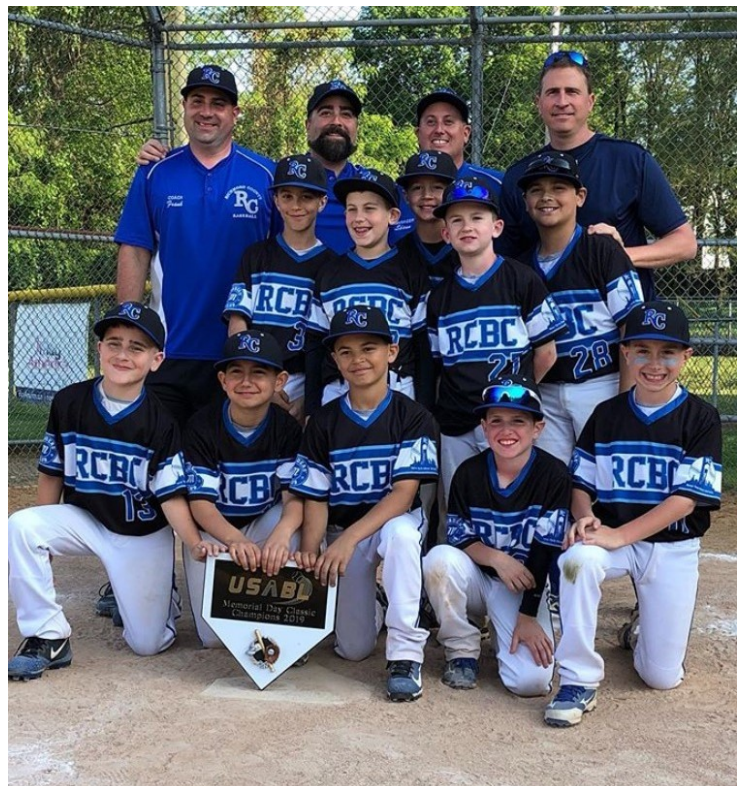
10U Americans USABL Marlboro Memorial Day