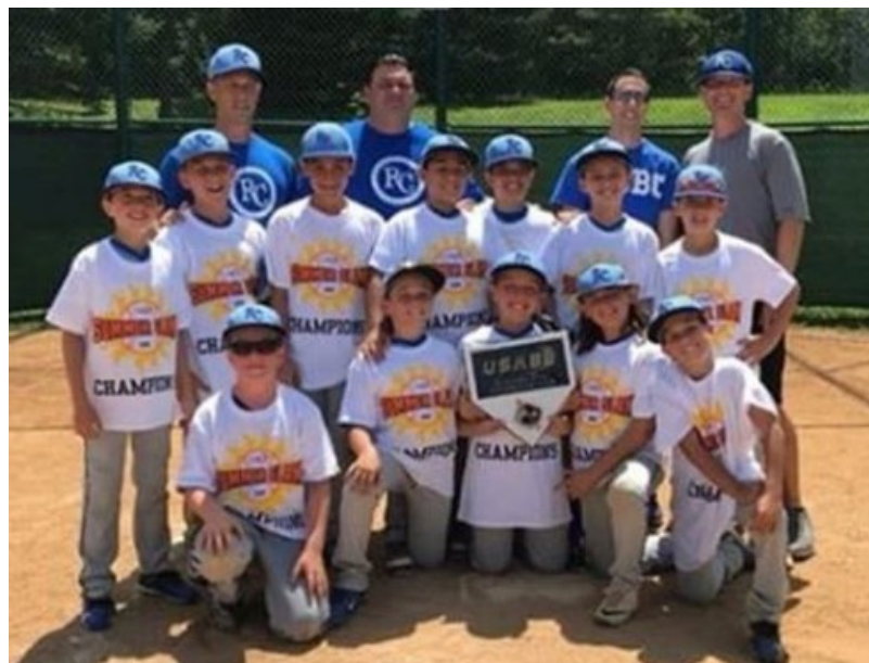
10U Nationals USABL Summer Slam Champs

For our fall tournament schedule, visit www.rctournaments.com .