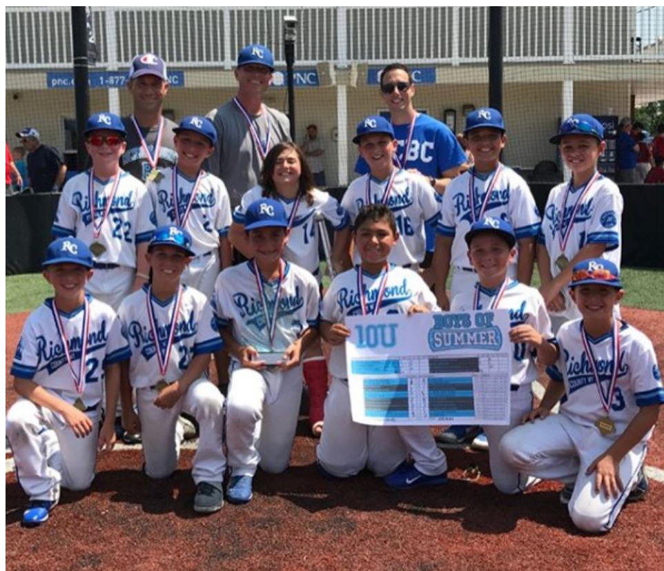
10U Nationals Diamond Nation Boys Of Summer