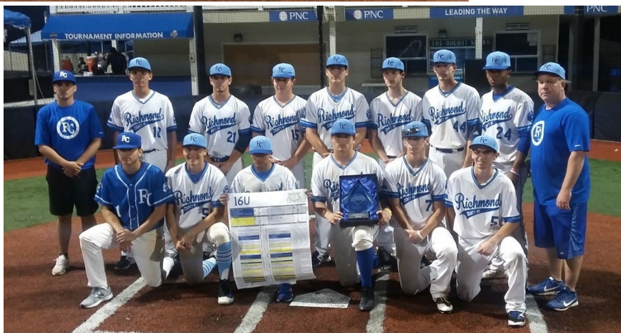
16U Nationals Diamond Nation Summer Bash