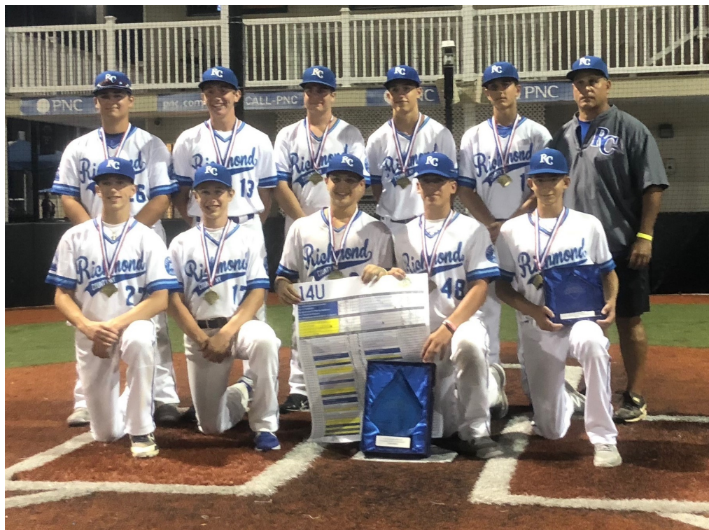
14U Nationals Diamond Nation Summer Bash