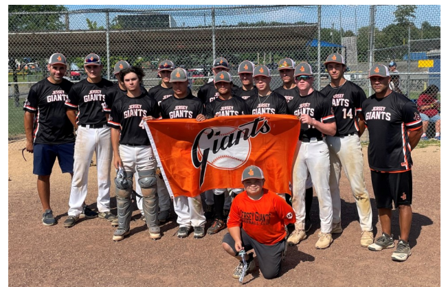
16U Champions South Troy Dodgers