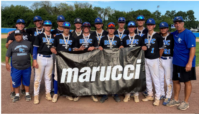
17U Champions RCBC Marucci 16U Nationals

We hosted the East Coast Invitational tournament (powered by Marucci) at the RC Complex which featured a Marucci Demo Day and equipment sales. Congrats to our champions and finalists.