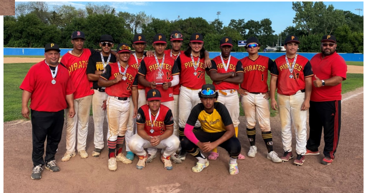
17U Runner Up Roberto Clemente Pirates