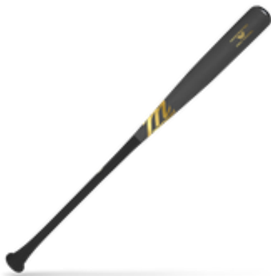
GLE Y25 (Gleyber Torres) Thin handle Large/long barrel Slightly end loaded

Marucci introduces three new Custom Pro wood bat models, now available on our Locker Room store.