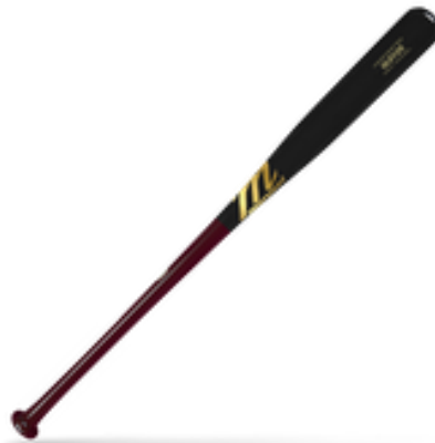
TVT (Trey Turner) Thin handle Medium/large barrel End loaded

For all your equipment needs, visit our Marucci Locker Room online store where RCBC members always get a discount.