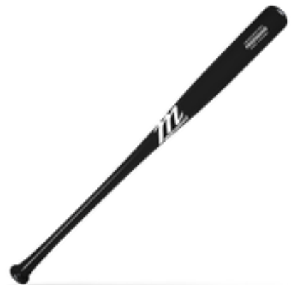
FREEMAN5 (Freddy Freeman) Thin handle Large barrel End loaded