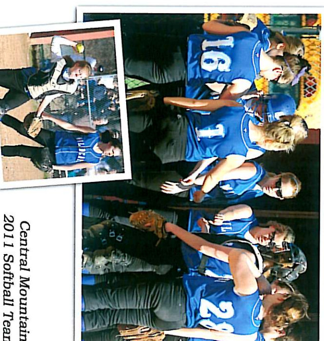
Central Mountain 2011 Softball Team

While the physical education and athletic complex at Central Mountain High School will be designed to eventually host all the activities intended; admittedly, all the funds to create all the facilities are not yet available. The following portions of the entire project are outlined that will create a top-notch facility for the entire community to use.