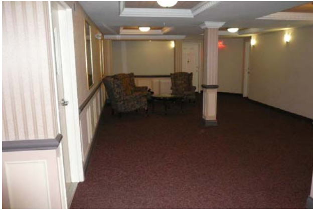
Lobby with Elevator