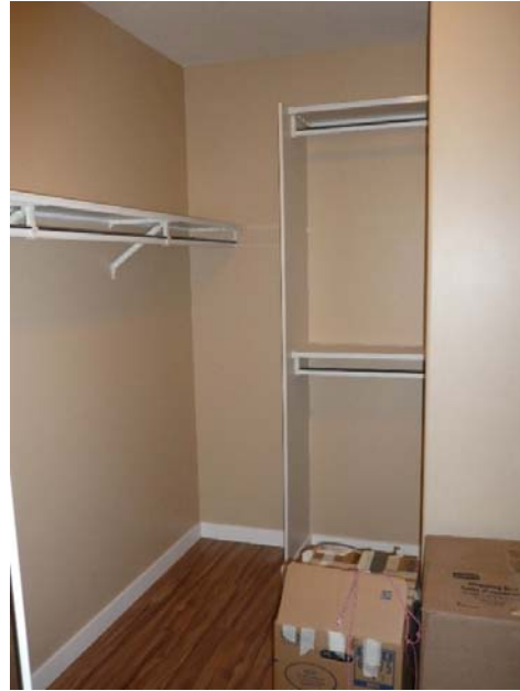
Bedroom – 14'6 x 11'4 – Spacious bedroom with laminate floors.