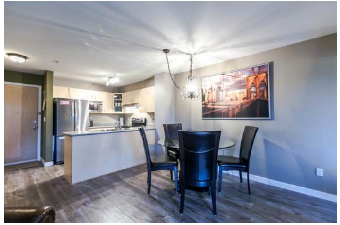
Kitchen – 8 x 7'2 - Attractive kitchen with stainless appliances and breakfast bar.