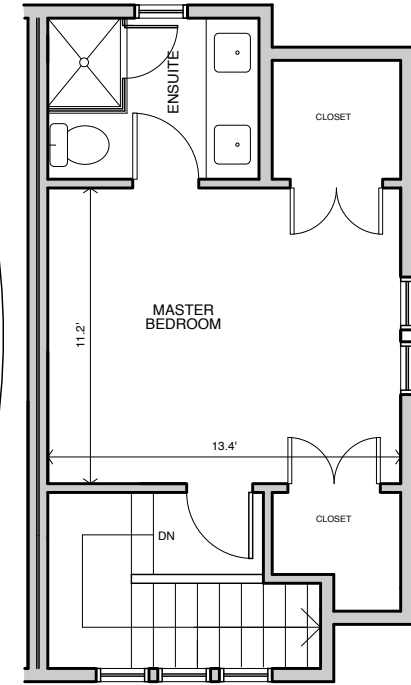
TOP FLOOR PLAN