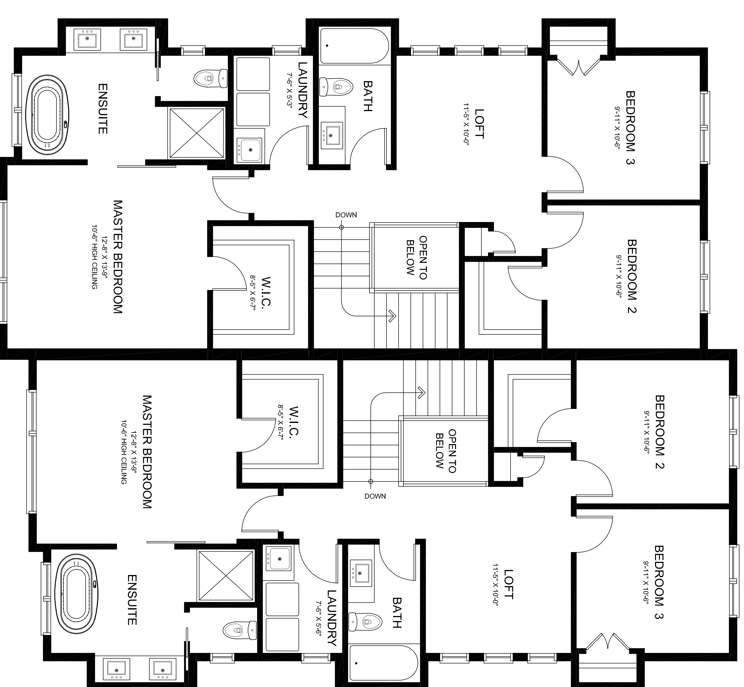
UPPER FLOOR PLAN - UNIT A

898 SQ.FT. MAIN FLOOR WALL HEIGHT 10'-1" ( 898 SQ.FT. COVERAGE )