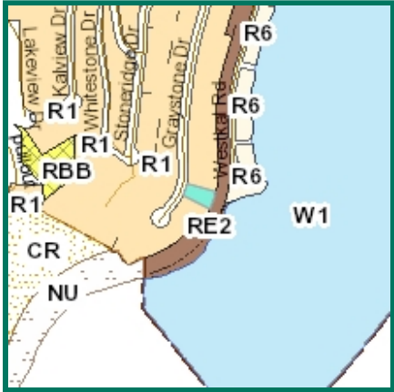
Property highlighted in blue