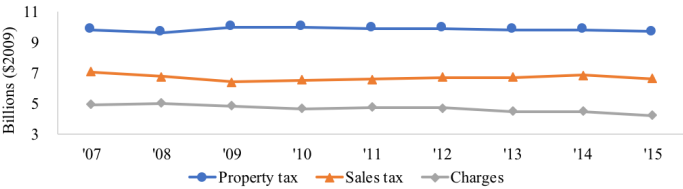
Office of NYS Comptroller. Includes cities, counties, towns, and villages.

In response to the tax cap, local governments report cutting infrastructure investments and long-term planning. This creates a vicious cycle: fiscal stress leads to underinvestment in planning and infrastructure, which in turn leads to economic decline and a further weakening of the tax base. This is not sustainable.