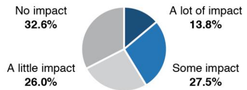
How significant are the following factors in motivating sustainability efforts by your local government?