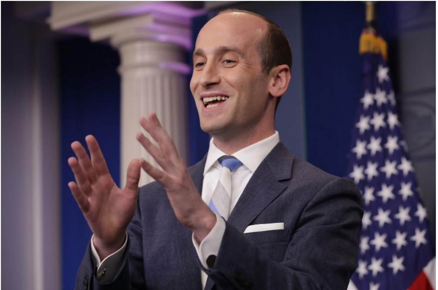
Senior adviser Stephen Miller sparred with CNN's Jim Acosta over the newly proposed immigration bill at the White House, Aug. 2, 2017.

"Switching away from this current system of lower-skilled immigration and instead adopting a merit-based system will have many benefits," Trump said during a March address to a joint session of Congress. "It will save countless dollars, raise workers' wages and help struggling families — including immigrant families — enter the middle class."