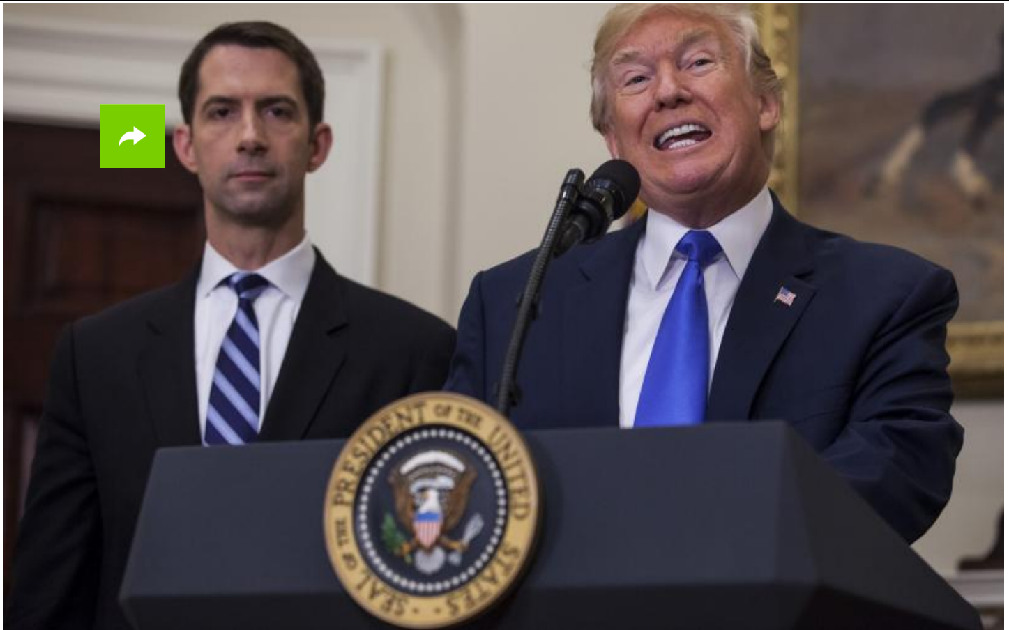
President Donald Trump announces the bill reforming immigration at the White House, Aug. 2, 2017.