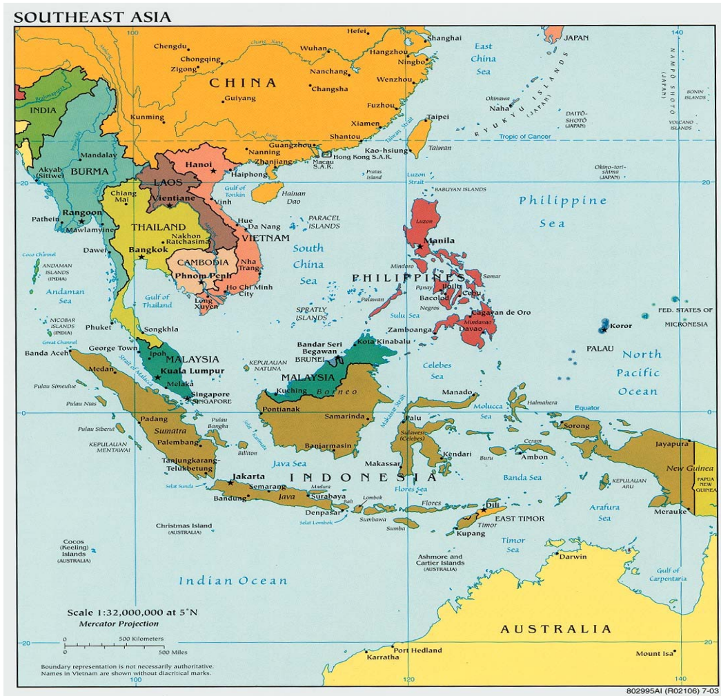
Map 1: Map of Southeast Asia