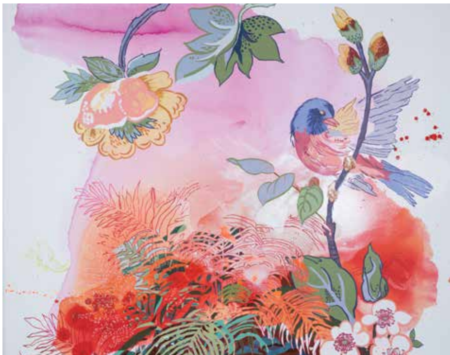
Not Such A Pressing Question 2015, Acrylic on canvas, 57 x 72 inches