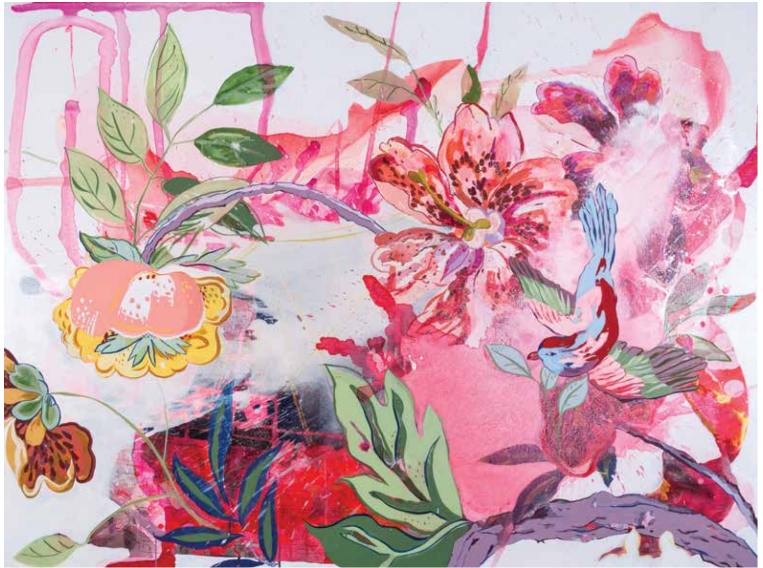
After the Ship Set Sail

2016, Acrylic, glitter on linen, 54 x 72 inches