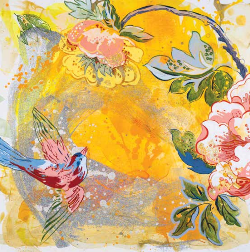
I'm Still With You

2016, Acrylic, glitter on linen, 48 x 48 inches