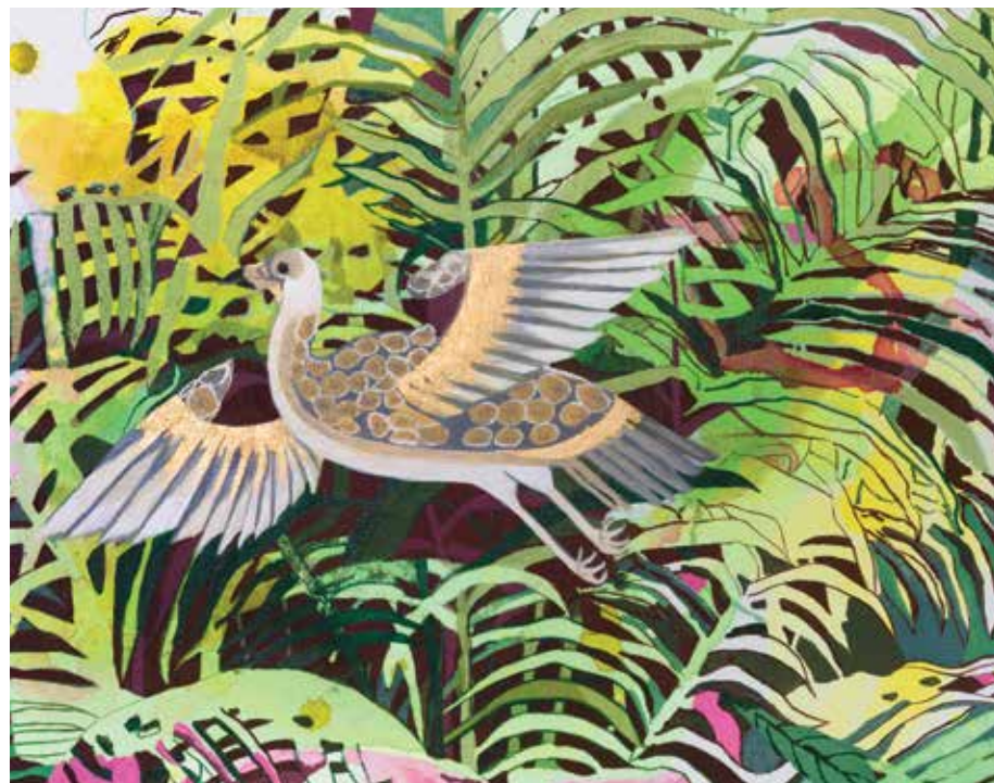
Chinese Bird 2016, Acrylic, ink on canvas, 16 x 20 inches