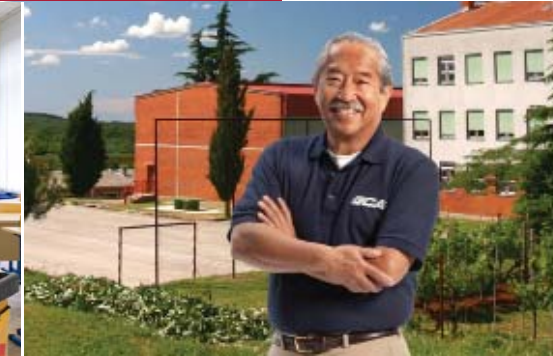
GROUNDS AND ATHLETIC FIELD MANAGEMENT