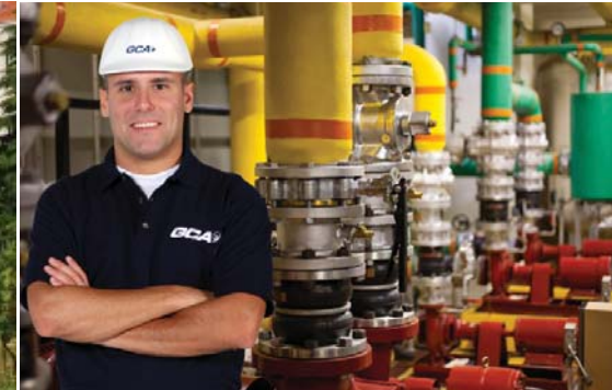
FACILITIES OPERATIONS AND MAINTENANCE