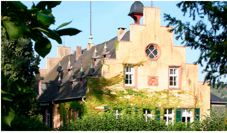
Maximin Grünhäus Estate