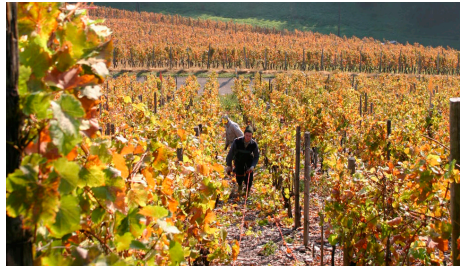
Harvesting in the Abtsberg Vineyard