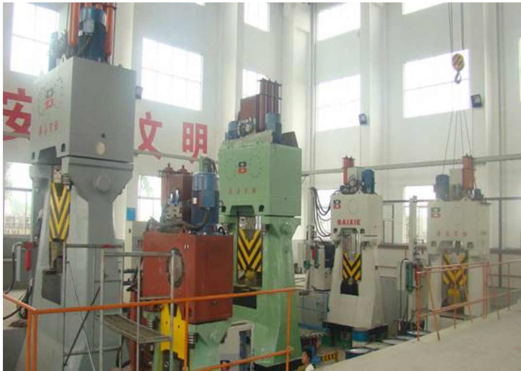
These two photos are about the assembly scenes in our company.