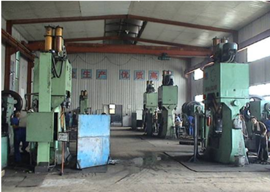
Five sets of CHK fully hydraulic die forging hammers used in one of our customers' company. This customer purchased five sets hammers successively from 2003 to 2007.