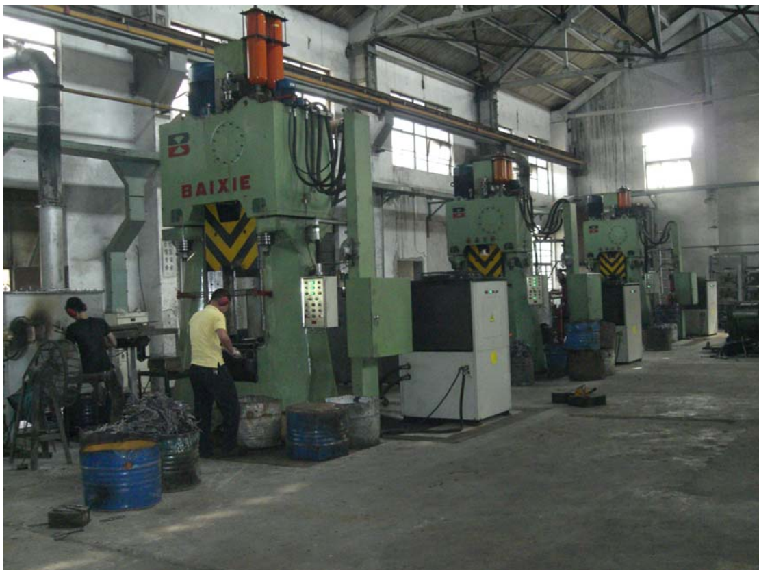
The three forging lines are used to produce surgical instruments. These three hammers are all CHK16 PLC fully hydraulic die forging hammers