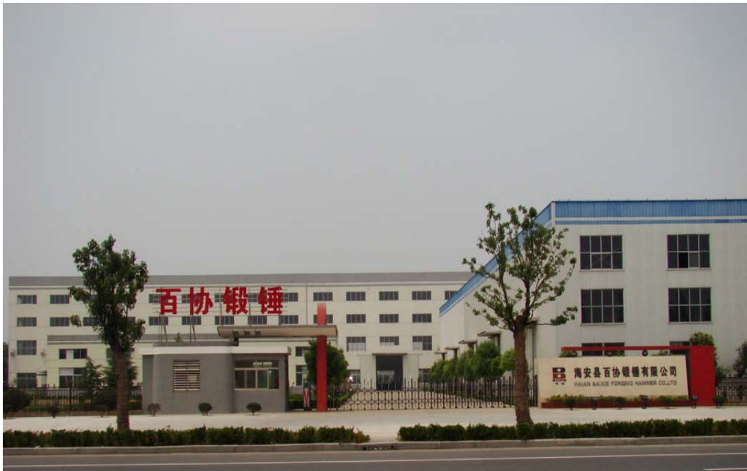
This photo is about a part of our company.

Haian Baixie Forging Hammer Co.,Ltd, found in 1954, is a professional manufacturer for forging industry. We have been making the PLC fully hydraulic die forging hammers since 2002. With the features of energy saving, environmental protection, high accuracy and reliability. Baixie's hammers become more and more popular. The forging hammers are widely applied in producing automobile parts, motorcycle parts, hydraulic tubes, hardwares, surgical instruments, hand-tools, stainless steel tableware, spaceflight industry; they are also the ideal equipment of manufacturing abnormal parts, such as, connecting rods, bend axes, rockers, fork, stainless steel knives and forks to forge and form precisely, and at the same time the die forging hammers can be operated with robots to realize automation.