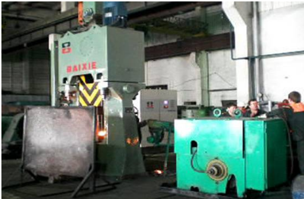
CHK 25 PLC fully hydraulic die forging hammer used in a company in Russia. And we also exported three hammers to Vietnam (two of the forging hammers were bought by a German who invested in Vietnam) and one hammer to Syria, and many investors from all over the world bought the forging hammers to invest in China.