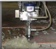
KMT Jetline 50hp Waterjet Pump