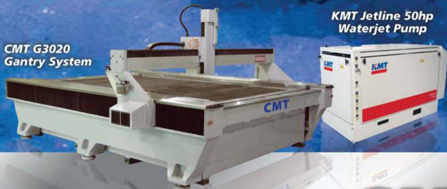
KMT Jetline 50hp Waterjet Pump