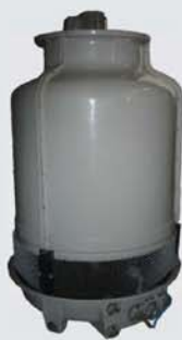
经济型风冷水冷却装置 Economical water fan cooler