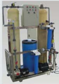
软化水装置 Water Softening Device