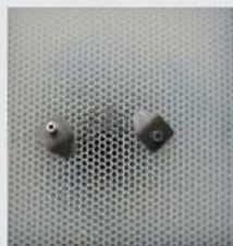
水刀垫砖 Water Jet Brick