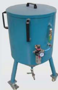
自动供砂系统 Auto abrasive feeding system