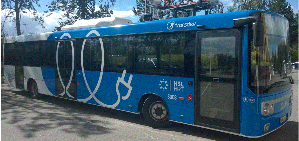
Figure 1. Linkker 13 side right