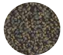
Brown Multi 9241 M

Contact us for 16 other colors available, minimum quantities apply. Rental floors available, please inquire at info@connorfloor.com