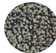
Gray 9245 M